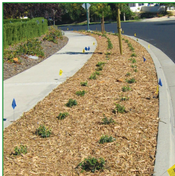
Landscape After Turf Replacement